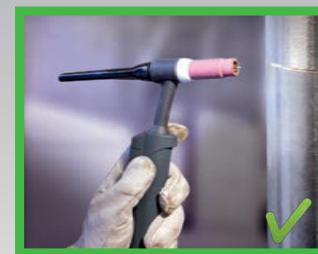
Clear shade 2