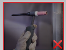
Clear shade 3